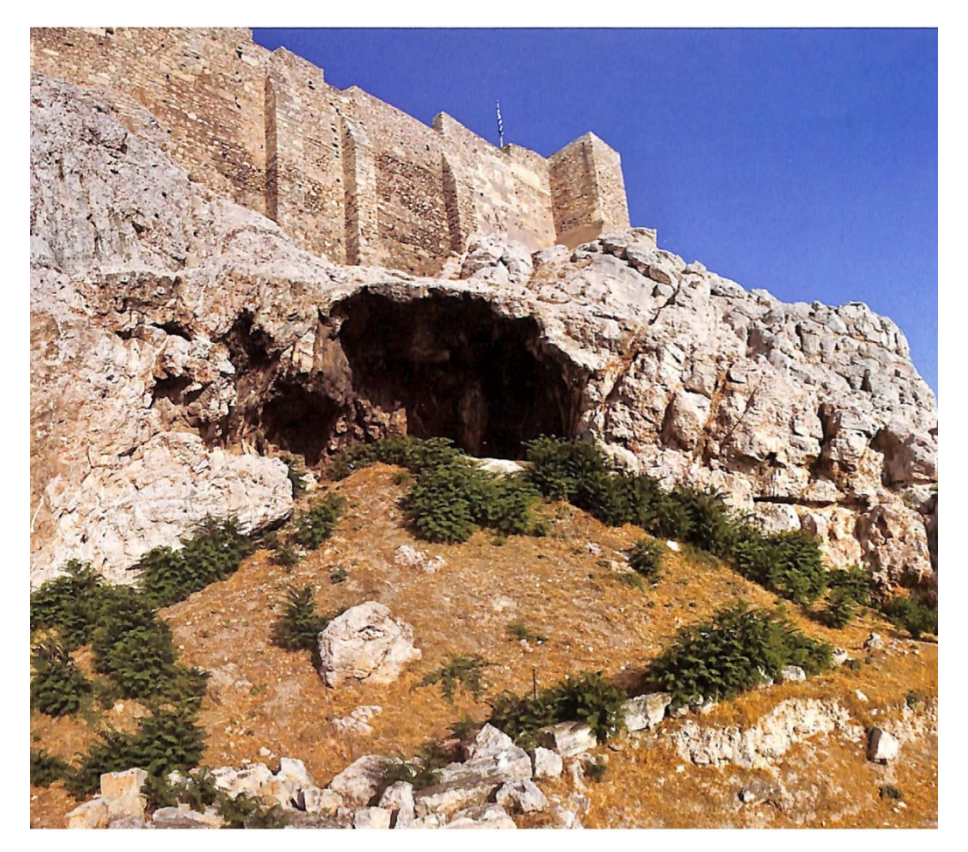
Figure 3: The shrine of Aglauros on the east slope of the Acropolis

Erechtheus has caused debate between scholars and has received mixed feedback, with some accepting (Kearns 1989, pp. 57-63; Kron 1999, pp. 78-79; Connelly 2014, pp. 147-148) and some rejecting (Gantz 1993, p. 218; Sourvinou-Inwood 2011, pp. 123-134) the identification. The Hyades did not simply receive cult as divinities but were transformed into stars by Athena herself. Catasterism is considered the greatest honor of all, given that the shining star becomes one with the cosmos (Connelly 2014, p. 147).