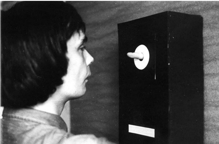
Figure 4: Finger by Monastyrski (1978).

In this section, I will discuss the performances of the Collective Actions group. However, first, I would like to briefly touch on the early works of Monastyrski, by referring to Degot's (2012) argument. She notes the elimination of inequality between the subject and object as one of the aims of communism (Degot, 2012, p. 30). This aim, she says, took the form of eliminating the inequality between the artist and the artwork, and there was a practice of regarding an artwork as a kind of unalienated subjectivity—that is, as a “comrade-thing” (Degot, 2012). As mentioned earlier, Degot regards Stenberg brothers' Mirror of Soviet Community as a comrade-thing that reflects the truth of the citizen who reads the newspaper (Degot, 2012).