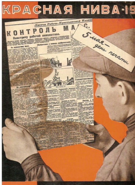
Figure 1: Stenberg brothers, Mirror of Soviet Community (1930). (from Degot, 2011)

Keti Chukhrov (2012) also points out that the Conceptualists dealt with an already conceptualized world. She mentions Soviet objects like pliers that exist only for the specific function of bending something and asserts that Soviet objects are inseparably linked with their ideal usage, which she describes as “eidetic” (Chukhrov, 2012, p. 84). There is a strong possibility that these objects influenced the works of Conceptualists. These Soviet objects would be keywords in Moscow Conceptualism studies. Thus, I would like to make an assumption to understand the Conceptualist view: Did they try not to rule the outer environment but to analyze the objects surrounding them instead? In other words, this paper is concerned with demonstrating how Conceptualists updated the interface between themselves and surrounding objects.