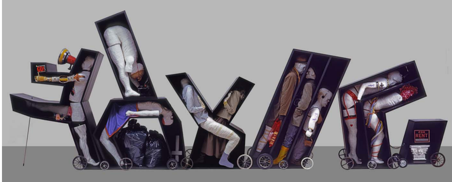
Figure 3: Yankilevsky, People in Boxes (1990). (from Yankilevsky, n-d.-b)

strike strange poses inside boxes. Their existence is depicted as covered or blocked by things, especially walls. The presence of two black garbage bags is suggestive as well.